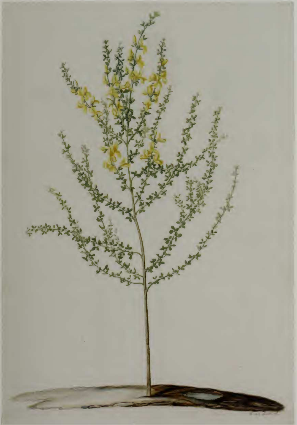
Figure 12.- Watercolor of Teline canariensis located at the Moninckx Atlas (vol. 3, t. 50) made by Maria Moninckx. Unknown date between 1686 and 1699.